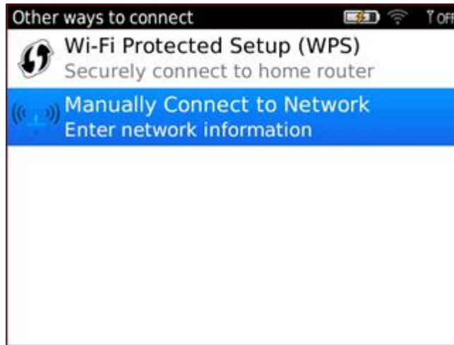
Figure 2 - Other ways to connect