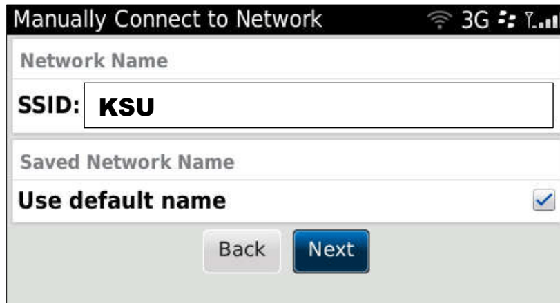
Figure 3 - Manually Connect to Network – KSU SSID