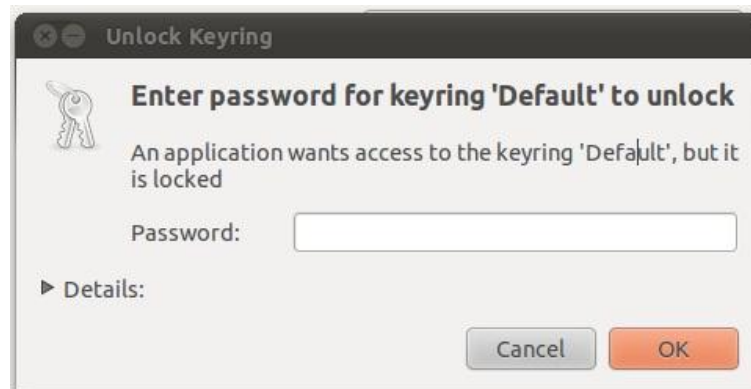
Figure 4 - Unlock Keyring

5. Type in your Admin password and click on OK .