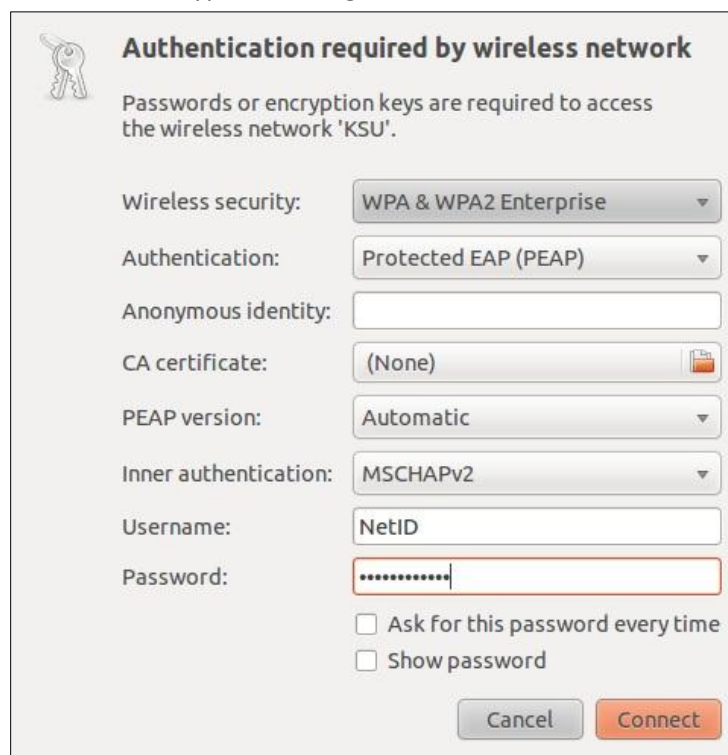
Figure 2 - Encryption Settings

**The Username is your NetID and the Password is your NetID password**