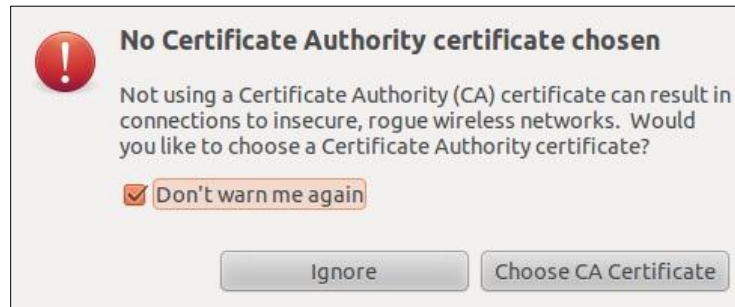
Figure 3 - No Certificate Authority

**Be sure to check the box next to “Don’t warn me again”