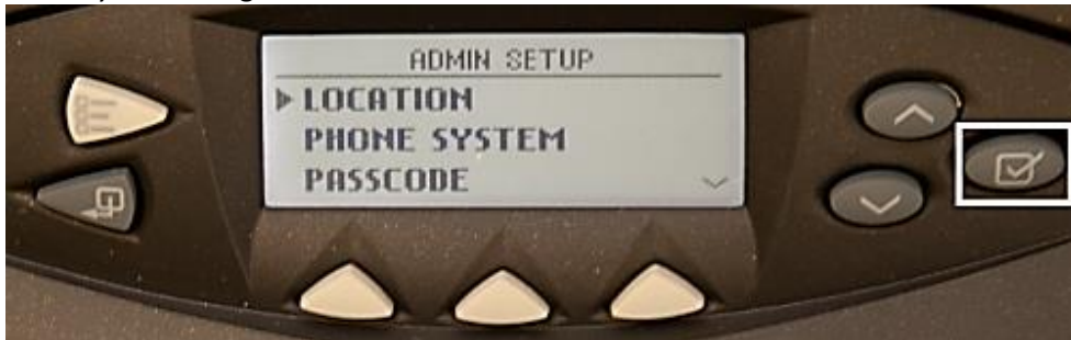
Figure 5 - Select Button