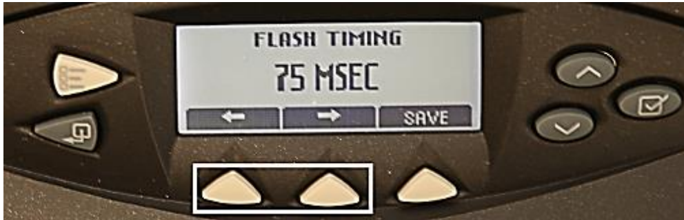
Figure 8 - Arrow Soft Keys