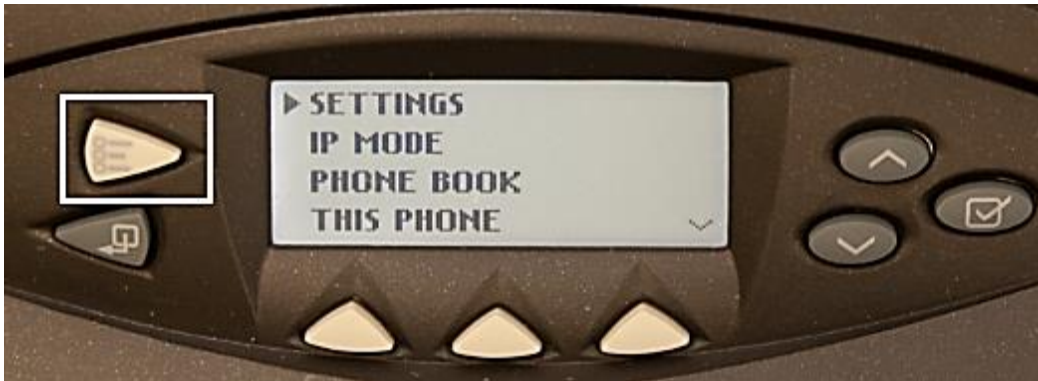
Figure 1 - Menu Button