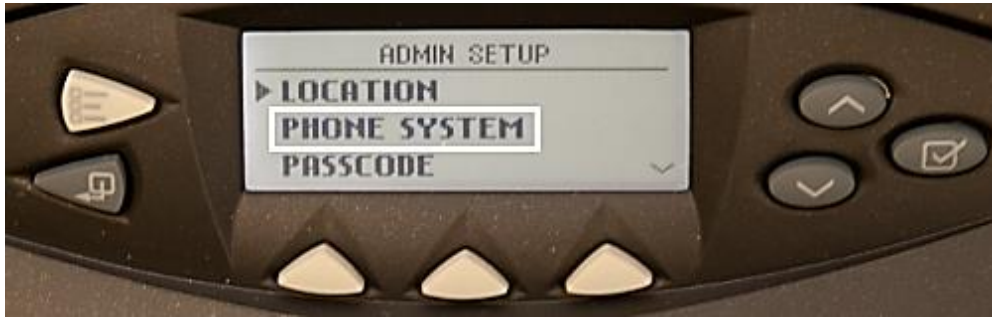
Figure 4 - Phone System