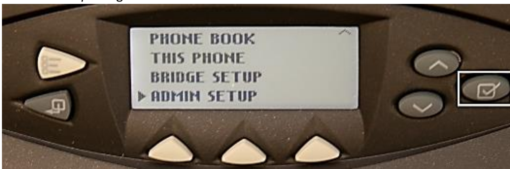
Figure 3 - Select Button