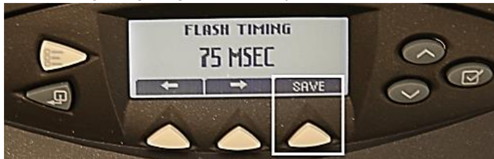
Figure 9 – Save Soft Key