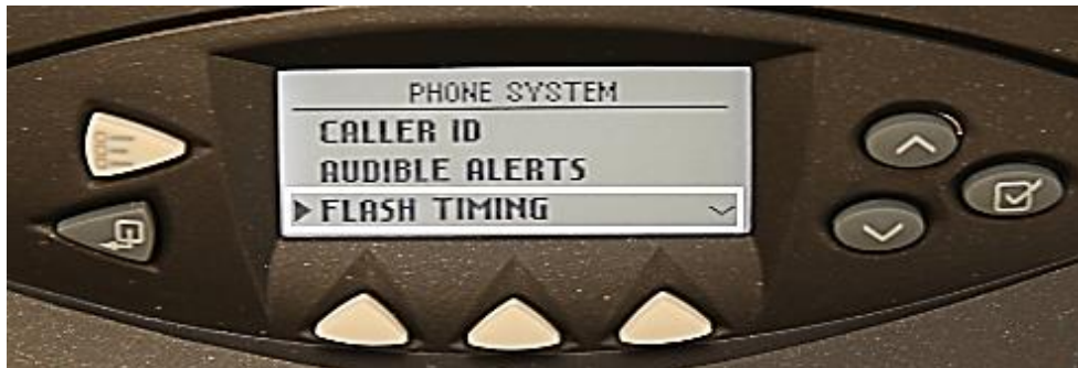
Figure 6 - Flash Timing