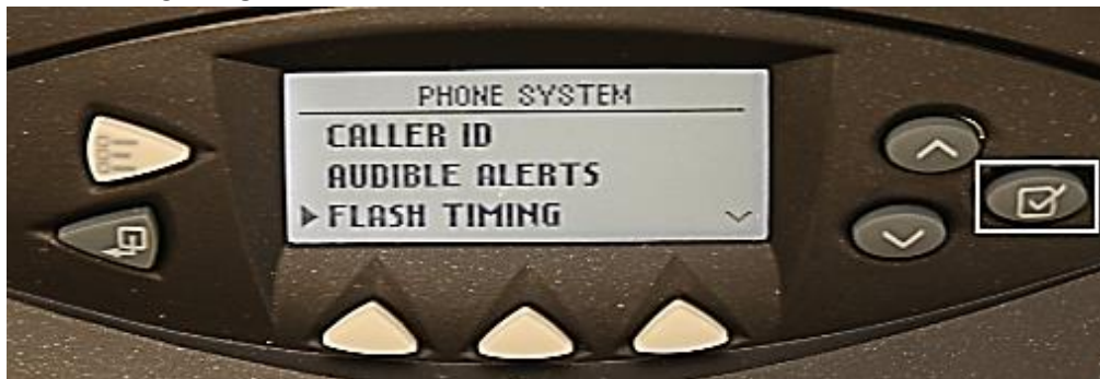
Figure 7 - Select Button