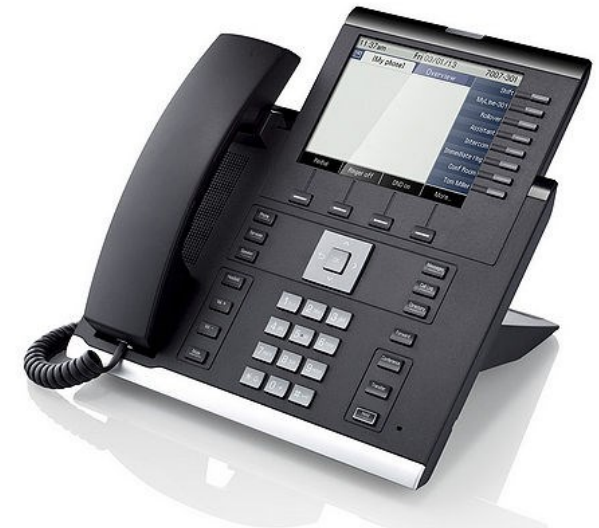
VoIP Desk Phone IP 55G