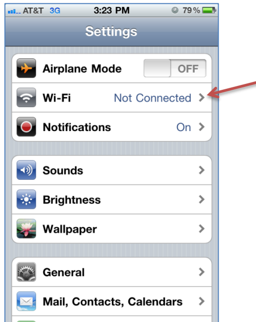
Figure 1 - Not Connected