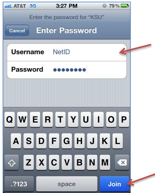
Figure 3 - Authentication with NetID